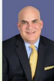
Director of Support for Disability and Long Term Care

Everyone is invited to this live and in person event with two very special guest speakers from Pulse Life Advocates and Knights of Columbus for Extended Care Planning.