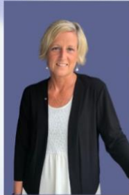
Executive Director of Pulse Life Advocates